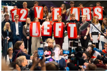
Polish students part of an international climate strike hold up signs at COP24, the United Nations conference for climate change negotiations in Katowice, Poland.

“One of the first orders of business for Speaker of the House Nancy Pelosi (D-CA) was to reinstate the Select Committee on the Climate Crisis... Speaker Pelosi announced that the Select Committee’s